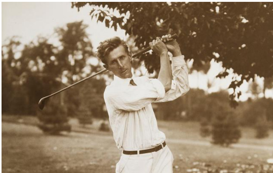
Jim Barnes – circa 1916