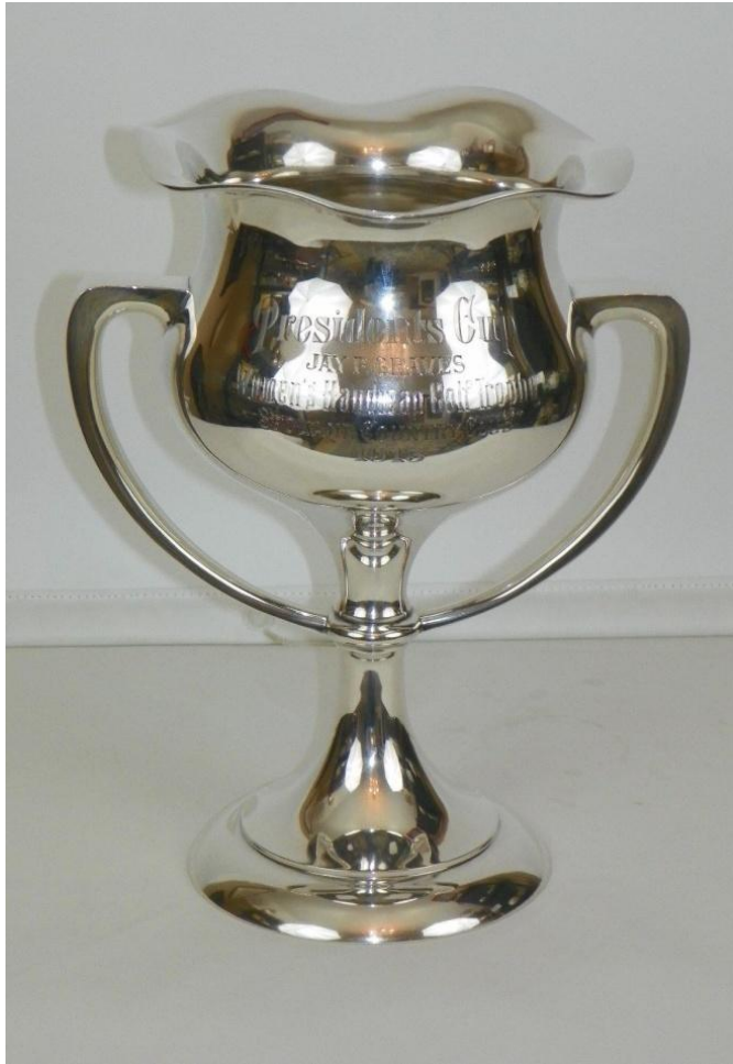
Women's Presidents Cup Trophy Spokane CC – 1913