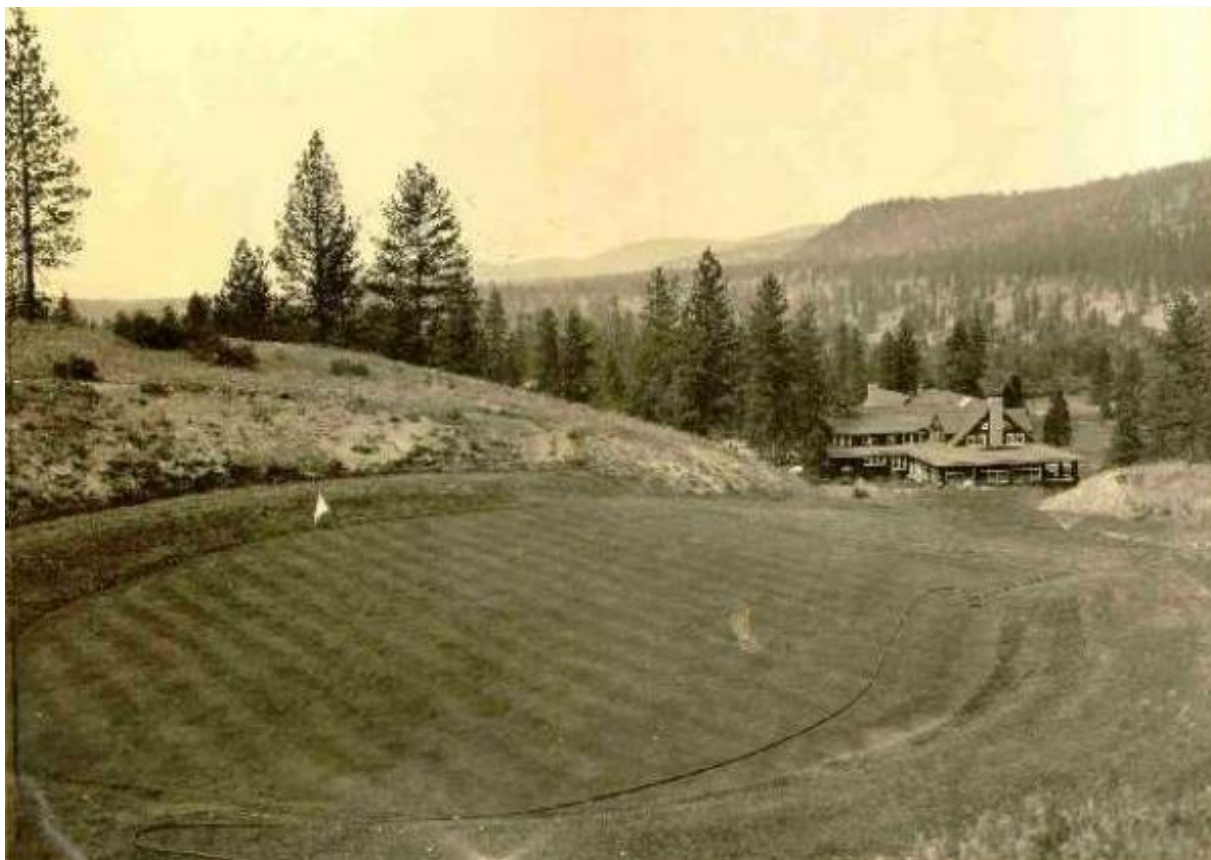
Spokane Country Club – Hole #10 green and clubhouse - circa 1920