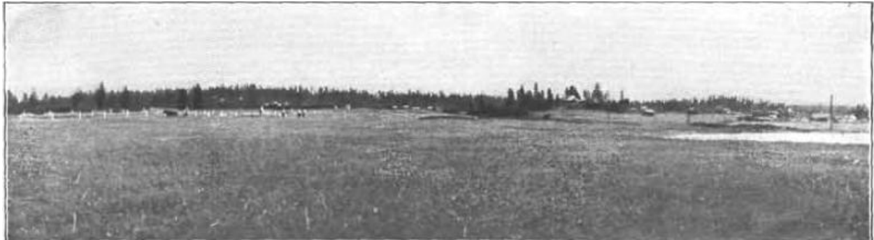
Spokane Golf Club. General View – circa 1901

“Perhaps the most distinctive feature of the course is the first tee. It is situated on the pinnacle of a high rock some fifty feet above the course, which is covered by a dense growth of evergreen trees for a distance of 100 yards from the tee, and which must be carried on the drive, since it is utterly impossible to play out of the trees. It is one of the most ticklish and awe-inspiring teeing-grounds the writer has ever encountered.”