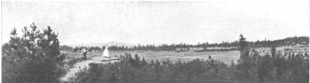
Spokane Country Club. Hole #1 tee – circa 1901

Considered the fourth oldest golf club in Washington State, Spokane Golf Club was founded on June 10, 1898. Newspaper accounts, however, tell that golf was being played in Spokane as early as 1894. A July 5, 1894 issue of the Spokane's Daily Chronicle published the following: "A new game is about to amuse Spokane. This game is golf, a sport which at first seems ridiculously simple but which in practice has held its victims with a strange fascination in every town where it as appeared."