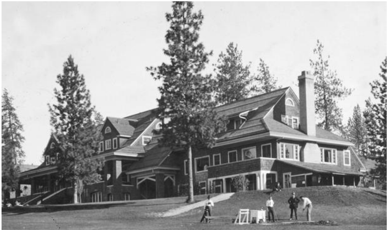
Spokane Country Club – circa 1928

Spokane Country Club would go on to host many important golf championships and holds the distinction of hosting the inaugural U.S. Women's Open Championship in 1946, won by Patty Berg. It was the only time that the Women's Open was played as a match play.