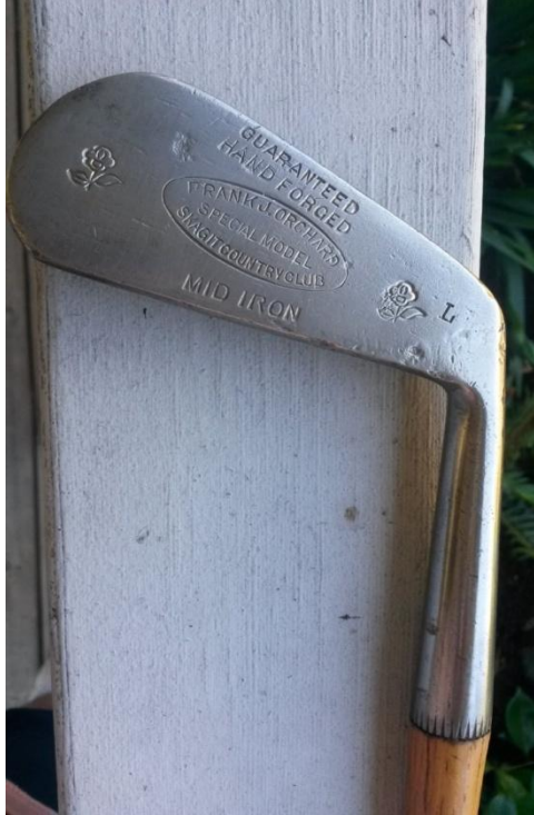
Skagit CC Stamped– Ladies Hickory Mid Iron

Match play was the predominant form of competition during this time. Many inter-club matches, more commonly known as “home and away,” were held with Bellingham G&CC and Everett G&CC. Members travelled as far away as Yakima, Olympia, and Aberdeen to play their matches.