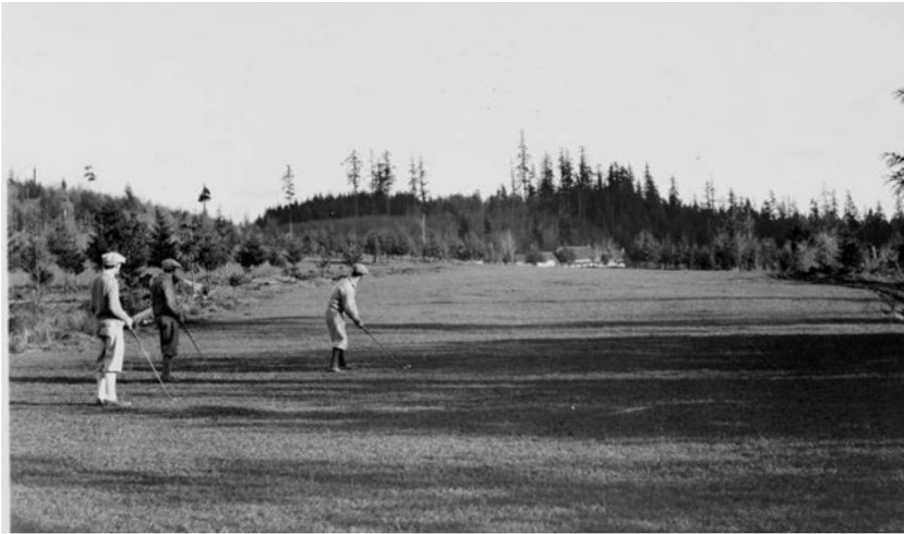
Longview Country Club par 4 - 9 th hole – 3-2-1927.