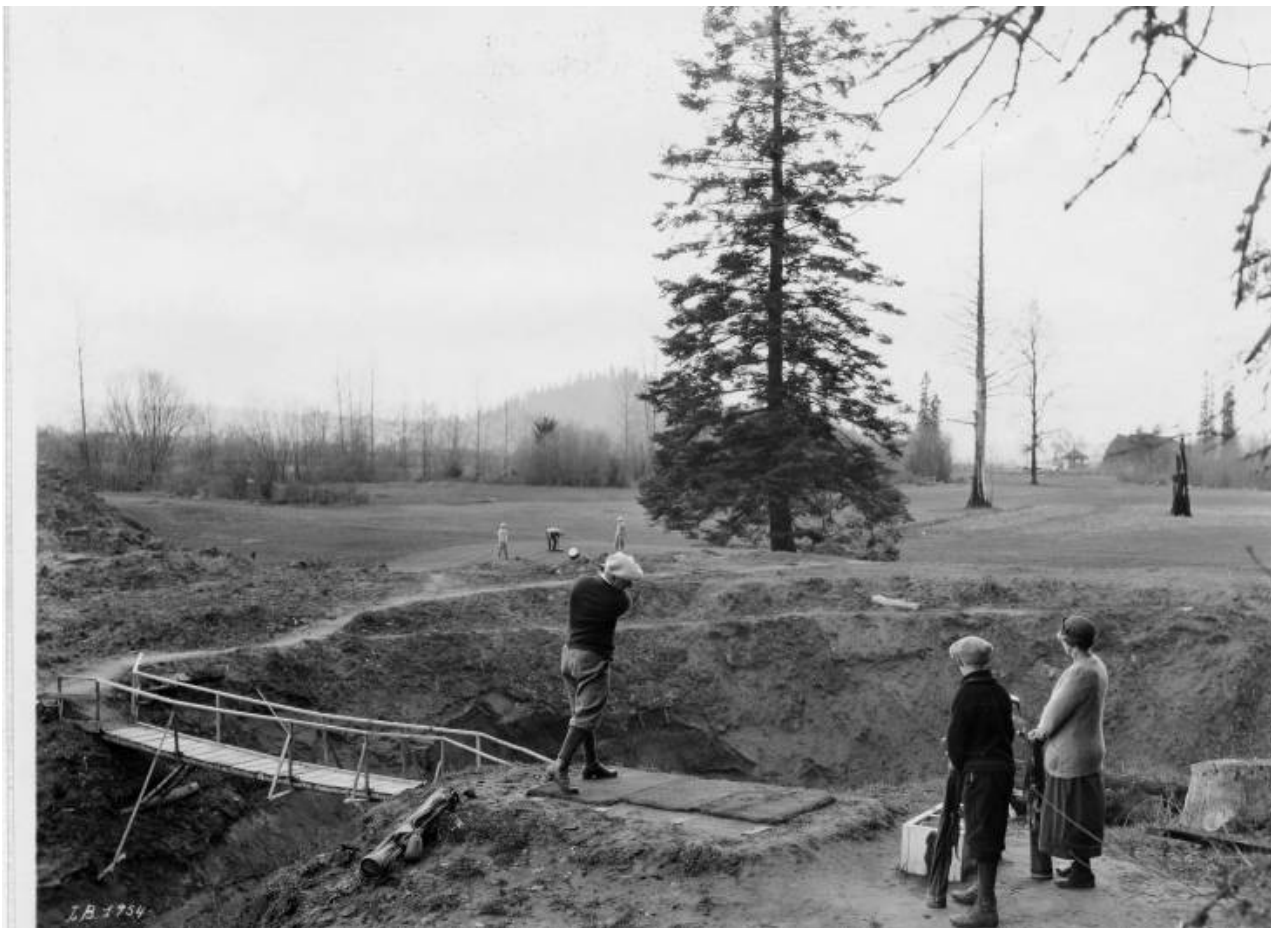
Longview's first golf course. Women were active in the club. - 3-17-1925.