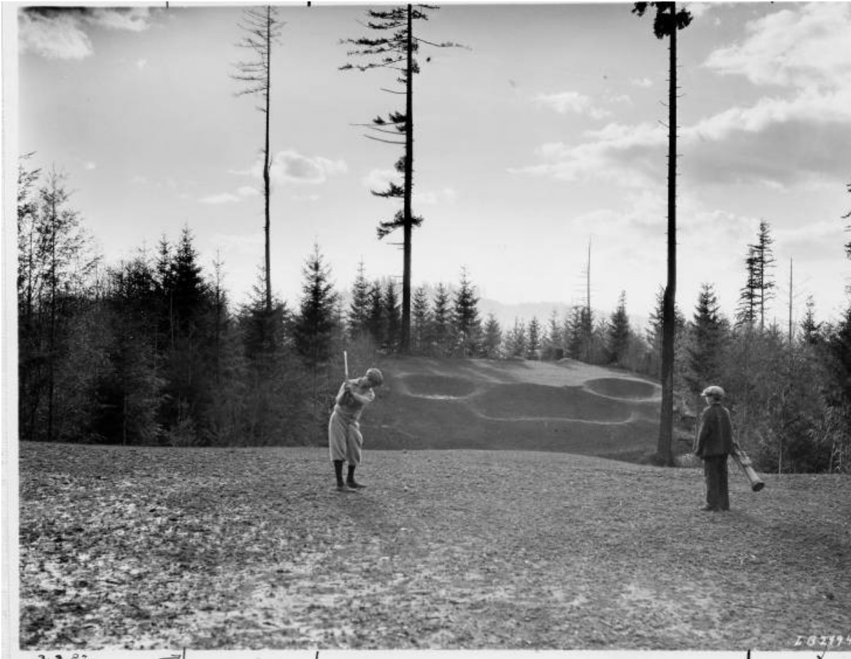
Longview Country Club par 3 - 7 th hole – 3-2-1927 (courtesy of Longview Public Library).