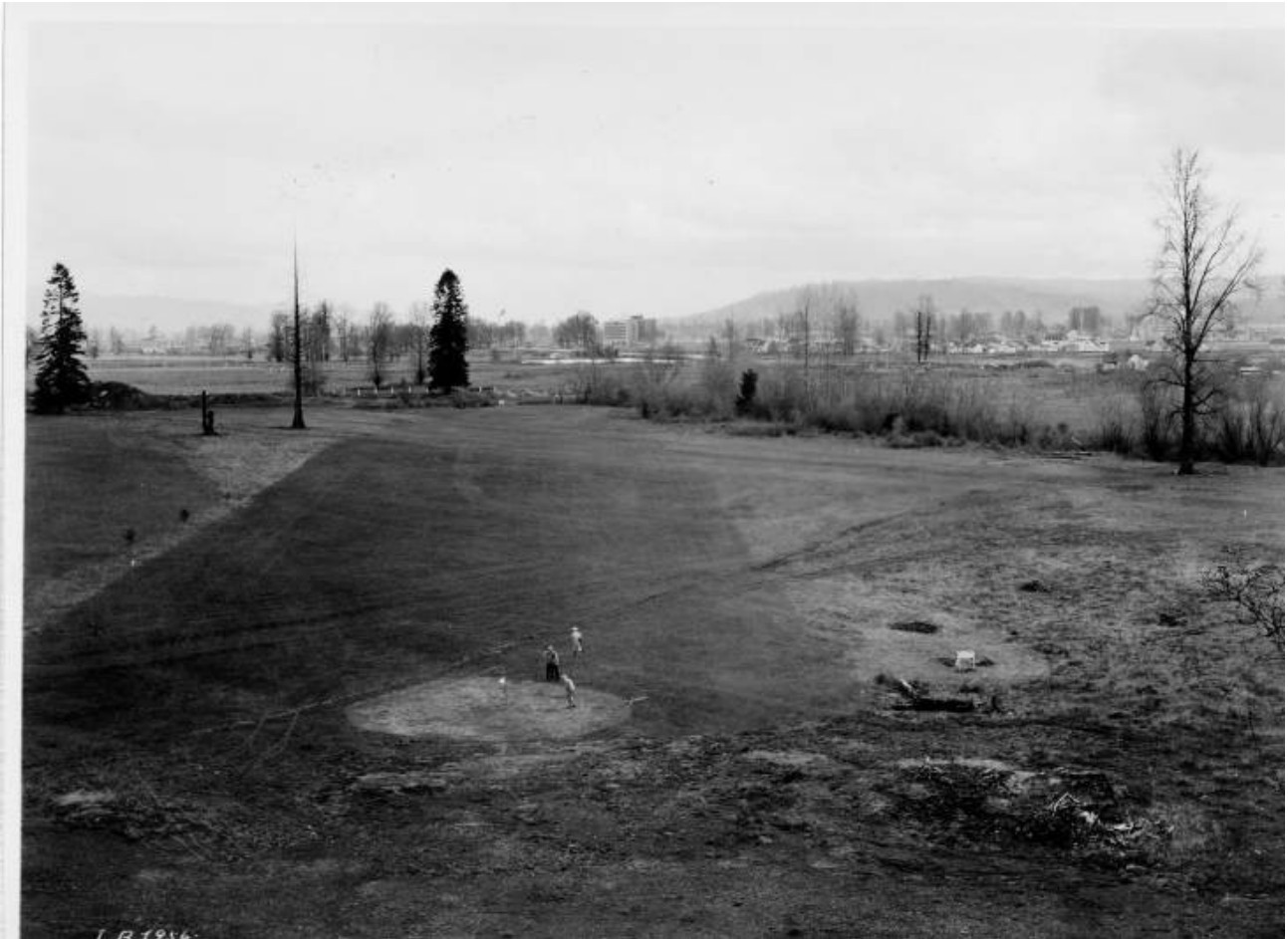
Longview's "lower" golf course. Hotel Monticello is in the background – 3-17-1925.