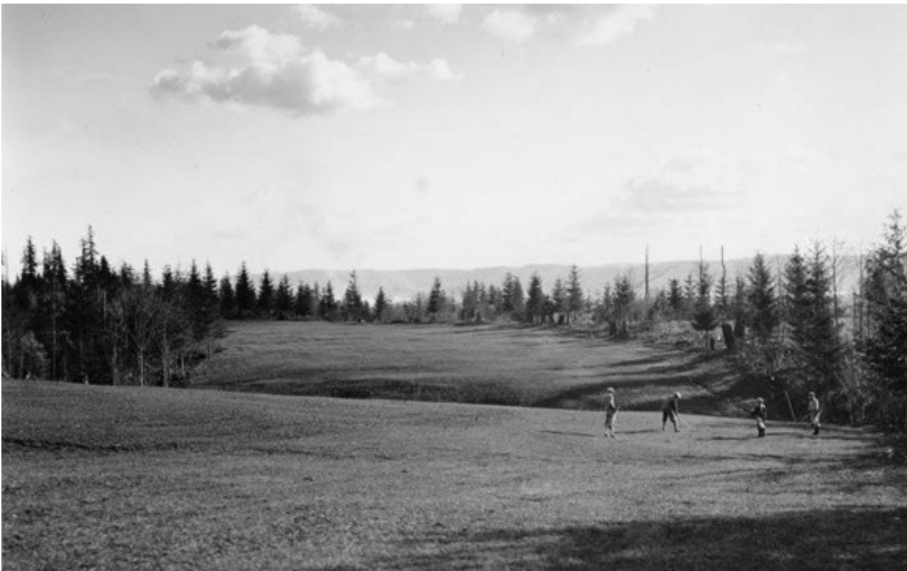
Longview Country Club's new course par 4 - 5 th hole – 3-2-1927.