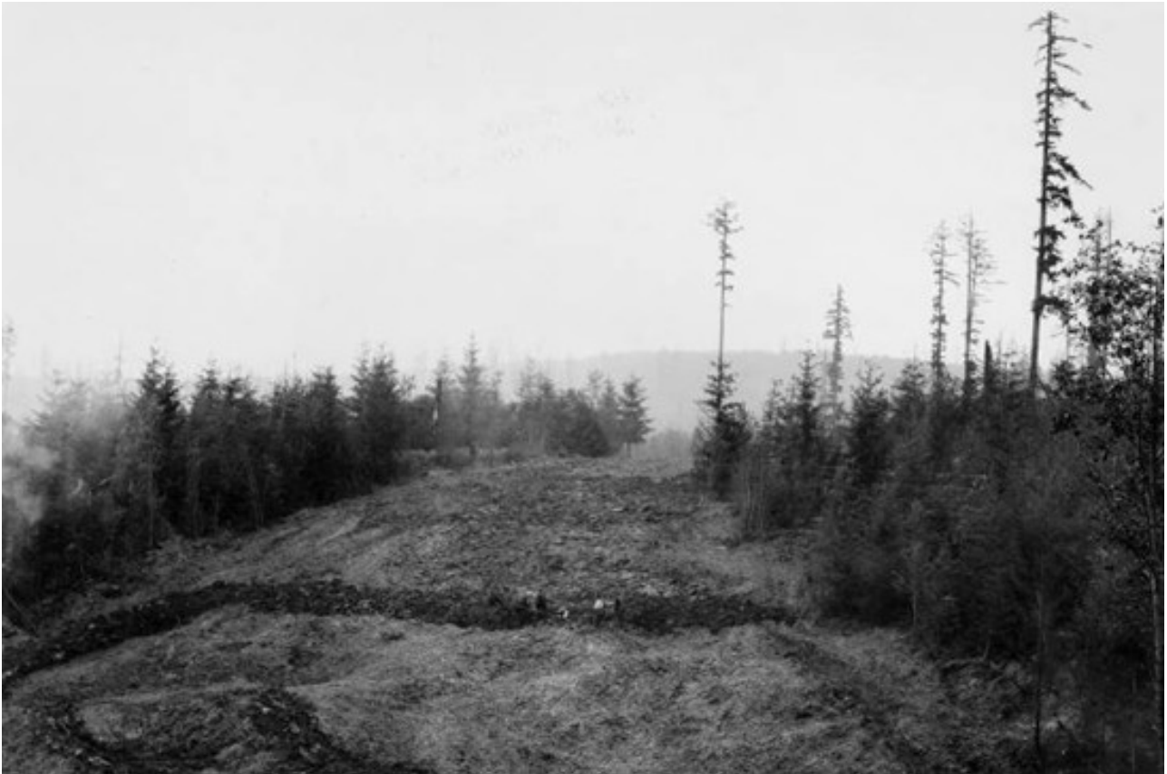
Longview CC's new course under construction. Horse team in center- 5-25-1926.