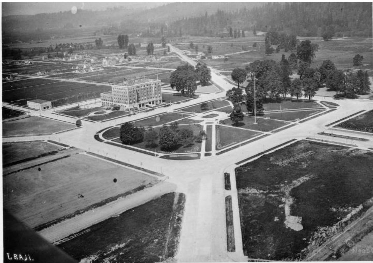
Aerial view of Hotel Monticello in the new planned City of Longview. The original golf course is in the upper left part of this photo – 4-30-1924.