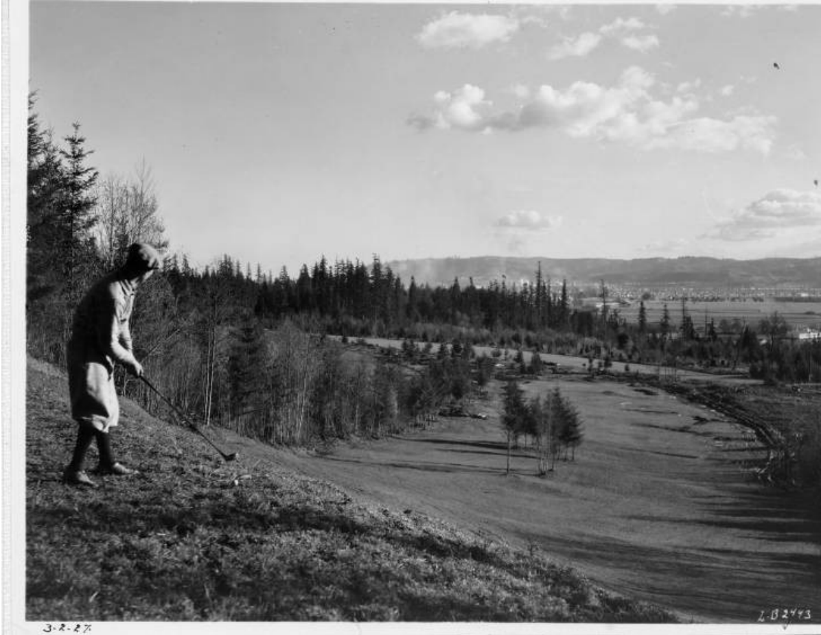
Longview Country Club par 4 - 8 th hole – 3-2-1927.