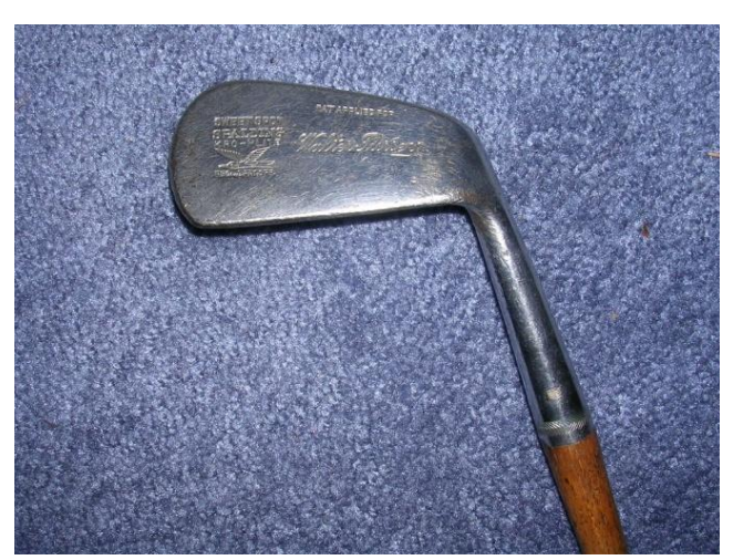
Walter Pursey Wood Shafted Iron

The Great Depression hit the club hard. Membership dropped from 500 to 48 and the club was forced to declare bankruptcy in 1934. The club reorganized and operated for some time before declaring its second bankruptcy in 1940. This time the club was forced to close its course. The beautiful clubhouse was rented out to the U.S. Coast Guard for war-time use, and the course became a grazing ground for sheep. Following World War II, the club reopened in 1946 and in a matter of few short years returned to become one of the top championship courses in the Northwest.