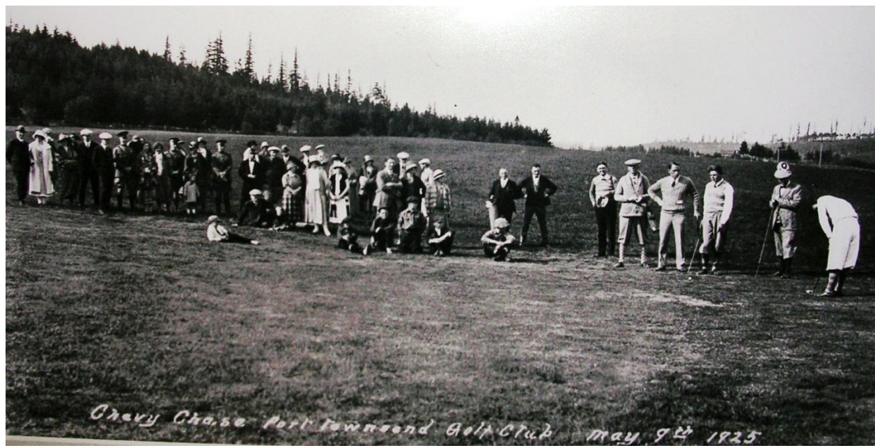
Opening Day

The Port Townsend Chevy Chase Golf Club opened for play on May 9, 1925: