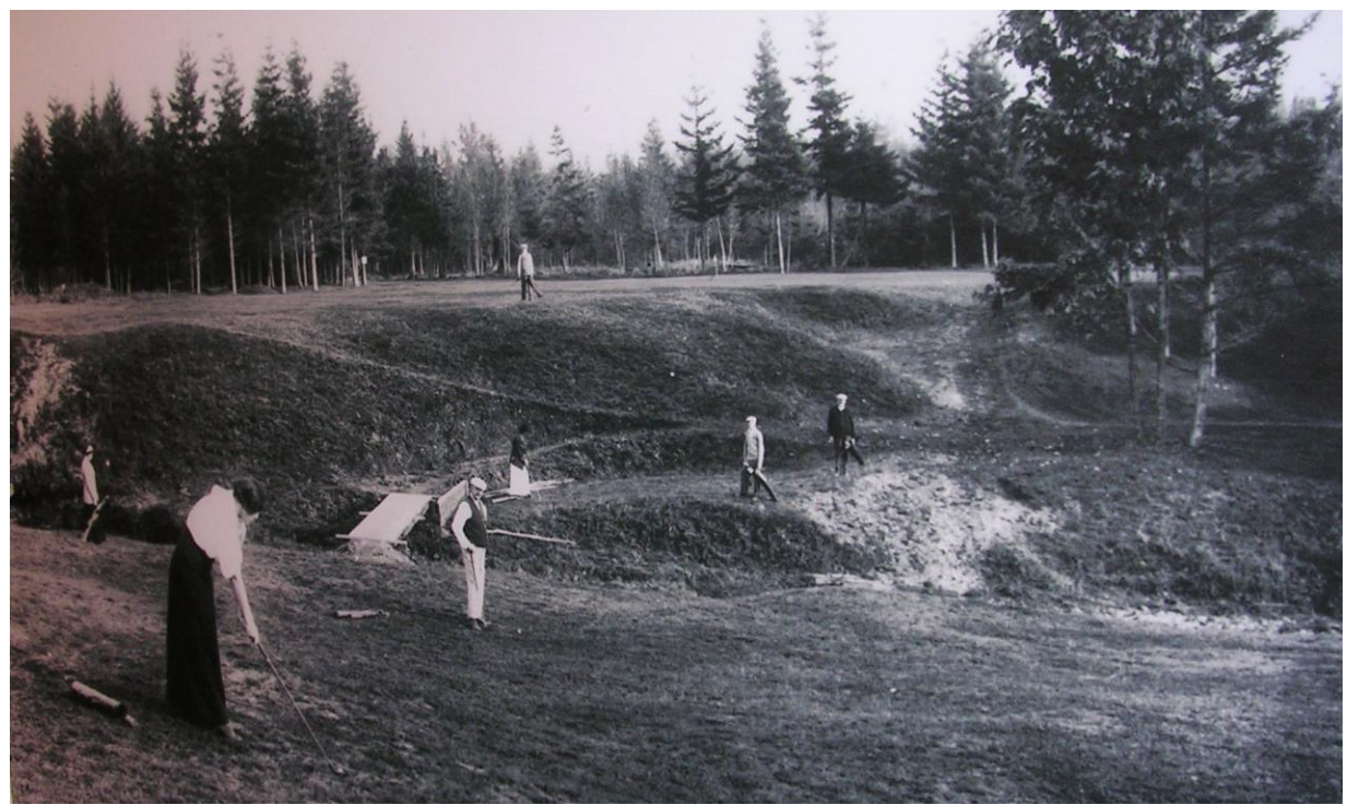
Hole # 1 (now #10) - circa 1913

One of the pioneering golf clubs in the Pacific Northwest, the Bellingham Golf and Country Club in Bellingham, Washington was established in 1912 and the original nine-hole course opened for play in 1913. But that was not the beginning of golf in the City of Bellingham.