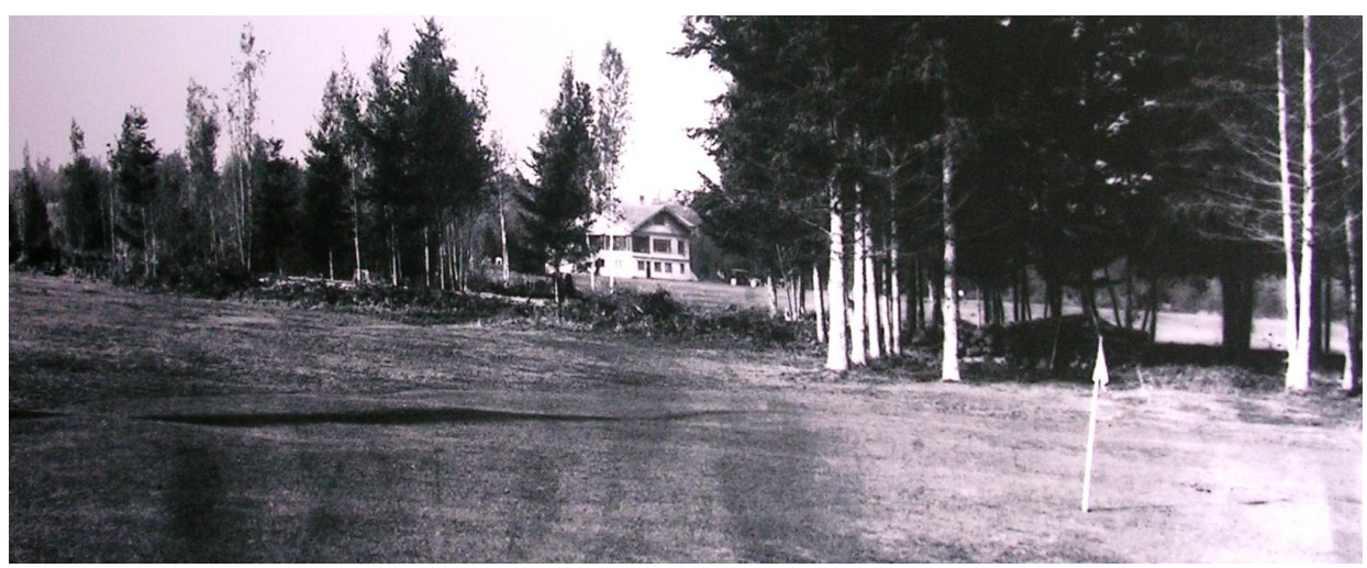
A view of the clubhouse – circa 1913

Over the years, the golf course has undergone many improvements and redesigns, yet many of the holes retain their original routing and characteristics. Known for its fast greens and well conditioned fairways, the Bellingham Golf and Country Club offers a stern test for today's golfers.