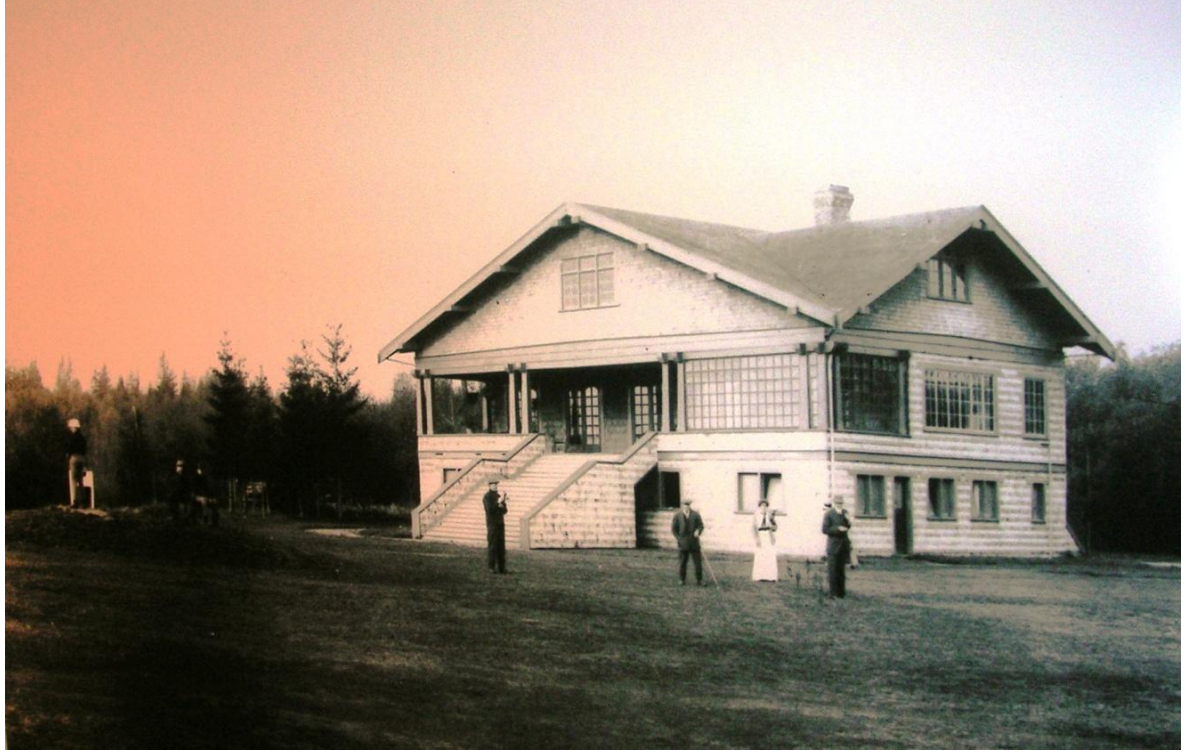
Clubhouse – circa 1913