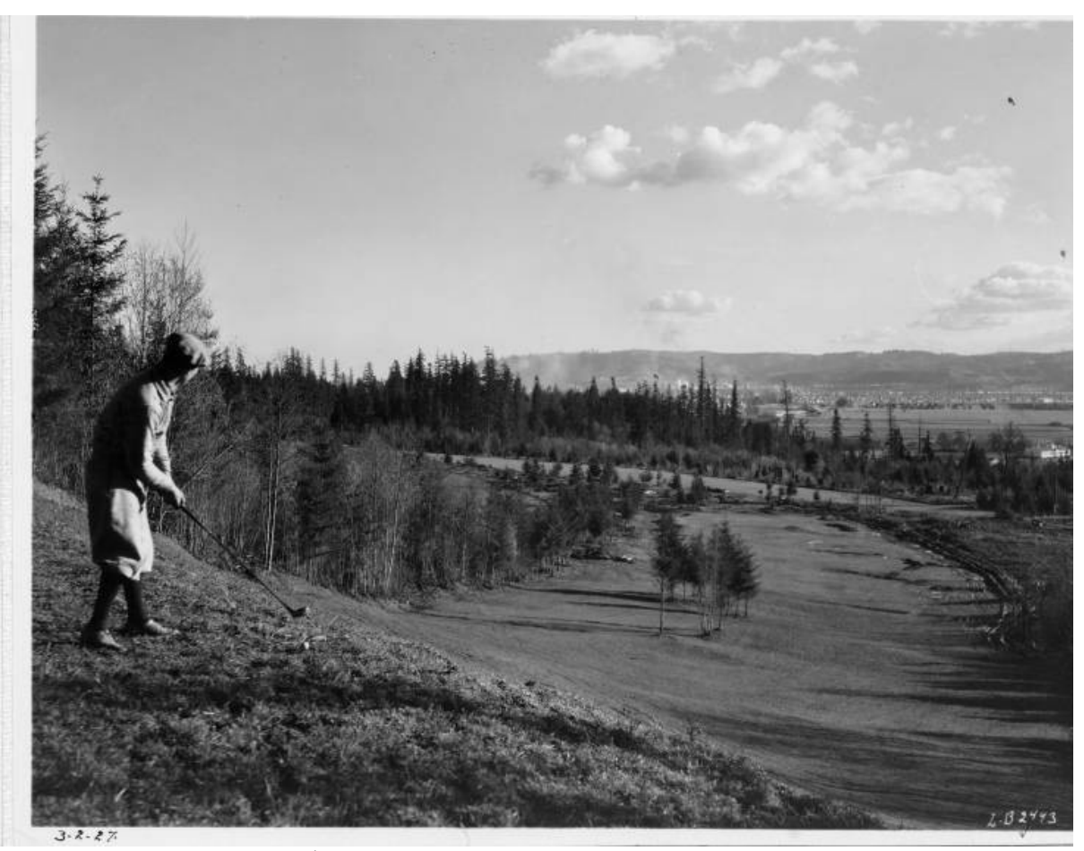
Longview Country Club par 4 - 8<sup>th</sup> hole – 3-2-1927 (courtesy of Longview Public Library).