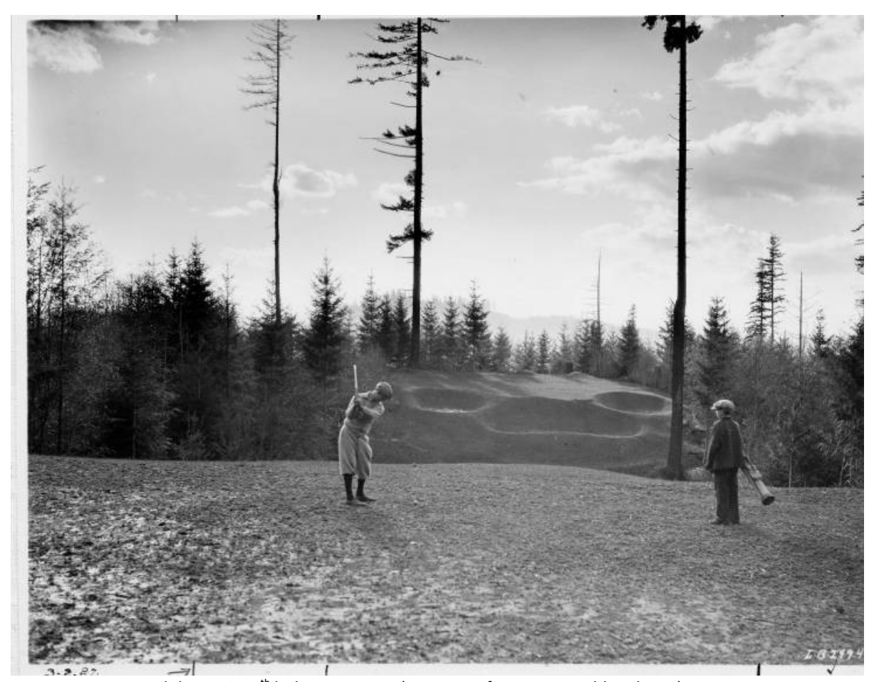
Longview Country Club par 3 - 7<sup>th</sup> hole – 3-2-1927.