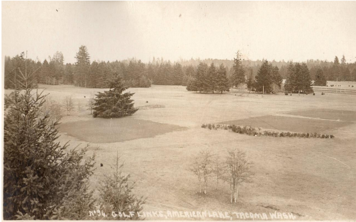
9 th & 18 th square greens ca. 1920

opened for play. The PPGA Championship scheduled to be held Tacoma in 1908 had to be relocated and Victoria Golf Club was selected in its place. Tacoma was finally able to showcase its new eighteen hole course in 1910 when it hosted the PPGA Championship that year. However, as late as 1921, the club was still struggling with the rocks and gravel issues.