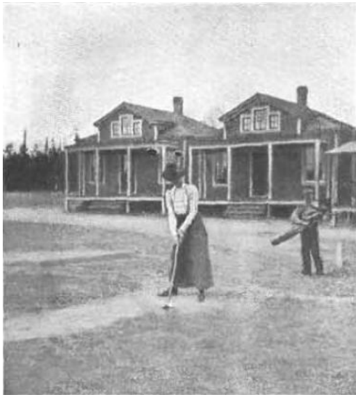
Club House and 1 st Tee circa 1900

A clubhouse, consisting of four adjoining red-shingled houses, was secured. One was used as the caretaker's home, another as the club room, another as the Men's locker room, and the last became the Ladies' locker room.