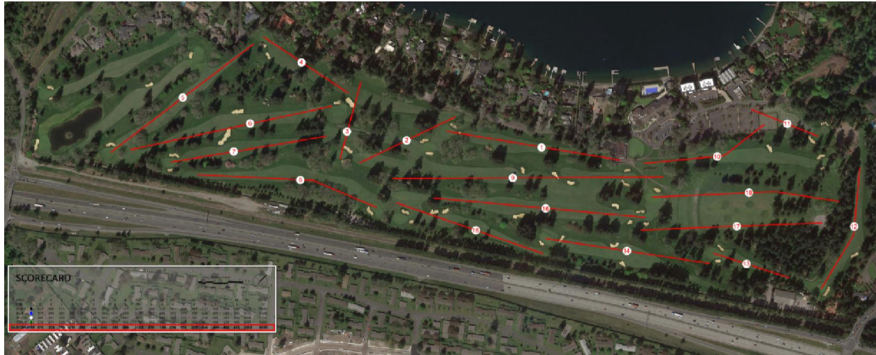
Prepared by Joel Kachmarek (numbered, red lines show the pre-1911 routing of holes overlaid over today's course)

The course has undergone numerous renovations over the years. The nines have been reversed, hole numbers have changed, the acreage has increased in size and new holes added. Joel Kachmarek, the greens superintendent at TC&GC and club historian, in a wonderful piece of research and analysis, has prepared following aerial map showing the original routing (as shown in red, numbered lines) overlaid onto today's routing. Holes 13, 14, and 15 on the south end of the course were added in 1989 by golf architect John Steidel, but otherwise a number of holes from the original layout follow the same contours of today's course.