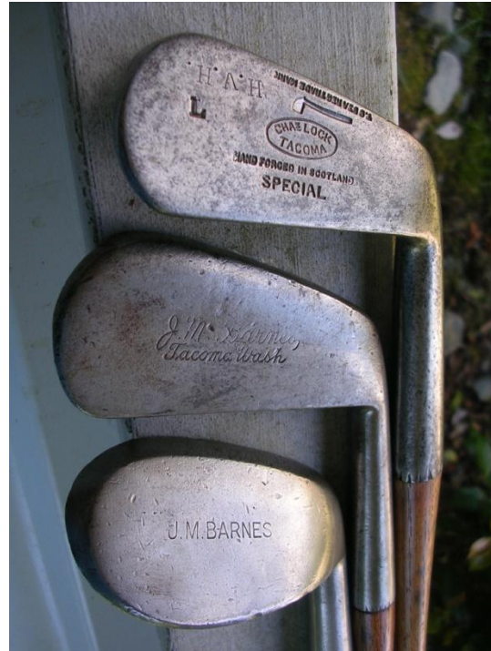
Lock and Barnes Hickory Clubs – circa 1906-13

In 1911, Barnes played a series of individual matches against members.