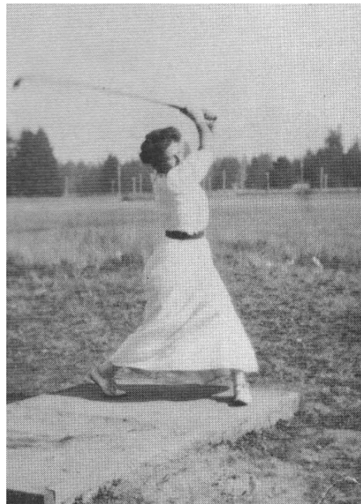
Ladies Play at Tacoma – c.1899 likely from the PPGA Championship

By 1900 Tacoma Golf Club had grown to 180 members and it became apparent that a new location and a larger clubhouse were needed to accommodate the growing membership. On October 18, 1904, the club acquired the seven-acre Lehman estate plus 160 acres of surrounding property on the eastern shore of American Lake, its current location.