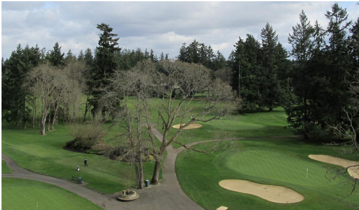
Same view ca. 2010