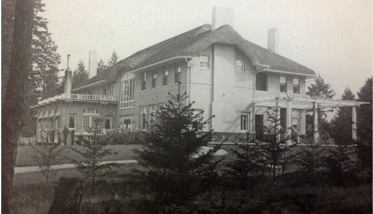
Tacoma C&GC Clubhouse "The Grand Old Lady" 1910-1961