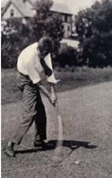
Jim Barnes (1886 – 1966) – circa 1913