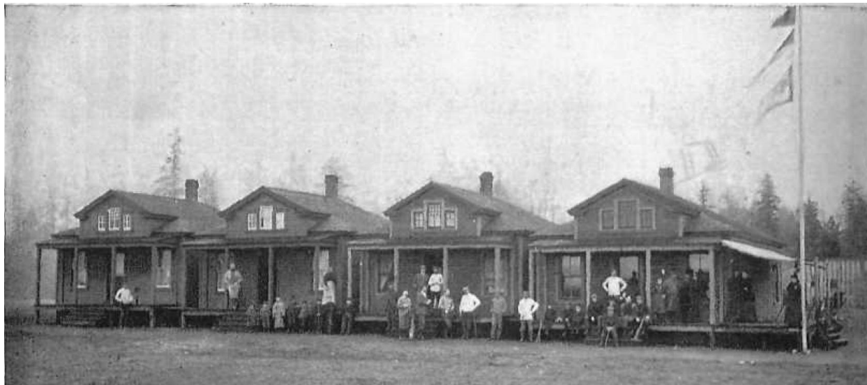
Tacoma Golf Club clubhouse in the prairie field of Edison in South Tacoma - circa 1899