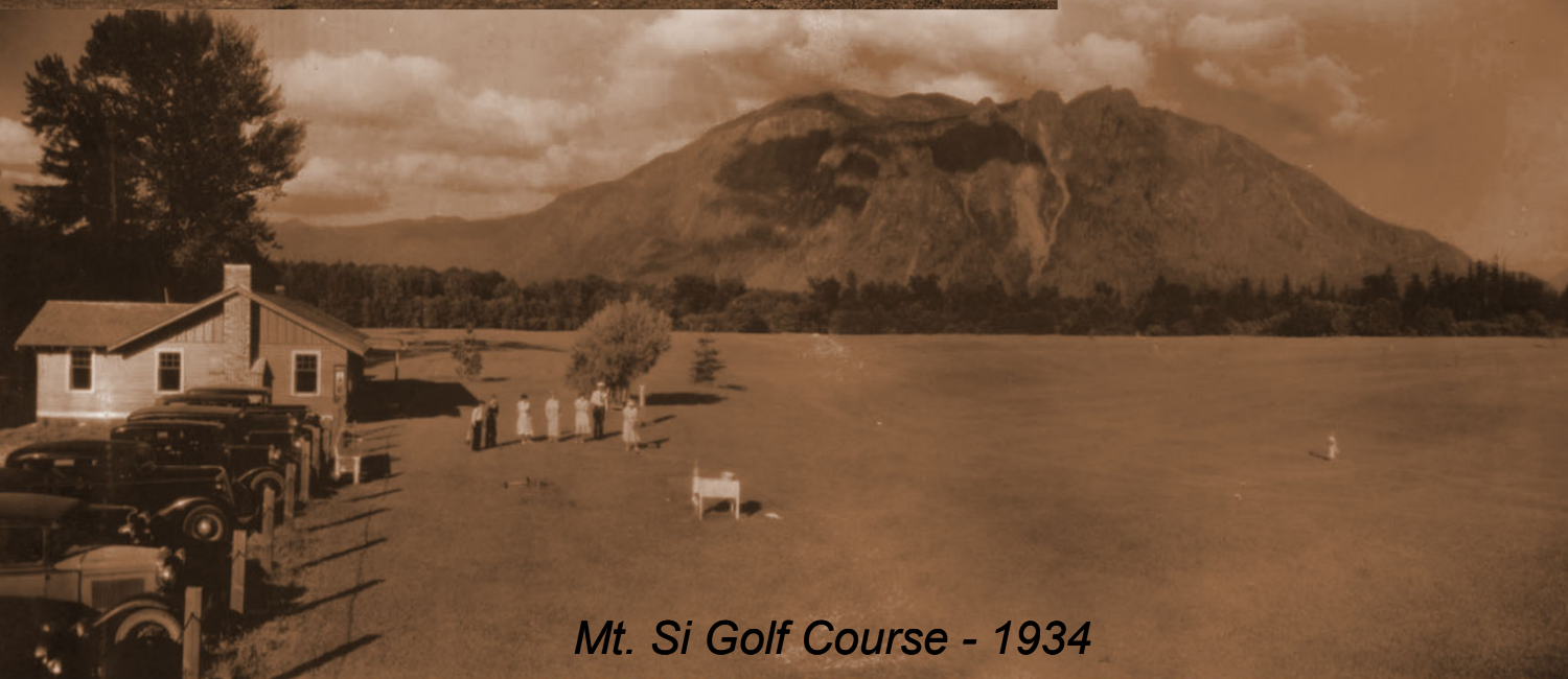
Mt. Si Golf Course - 1934