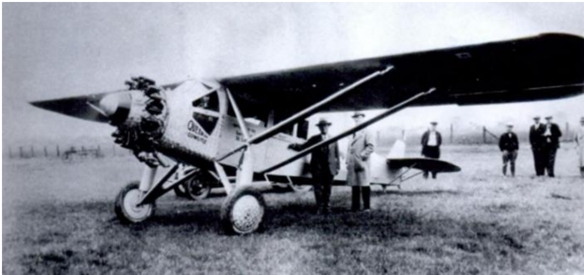
Sister plane to Charles Lindbergh's Spirit of St. Louis at Donahoe Airfield, adjacent to Riverside GC, in 1927