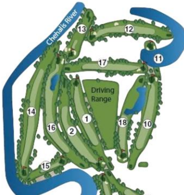
Riverside Golf Course (back nine plus holes #1 & #2) – 2026