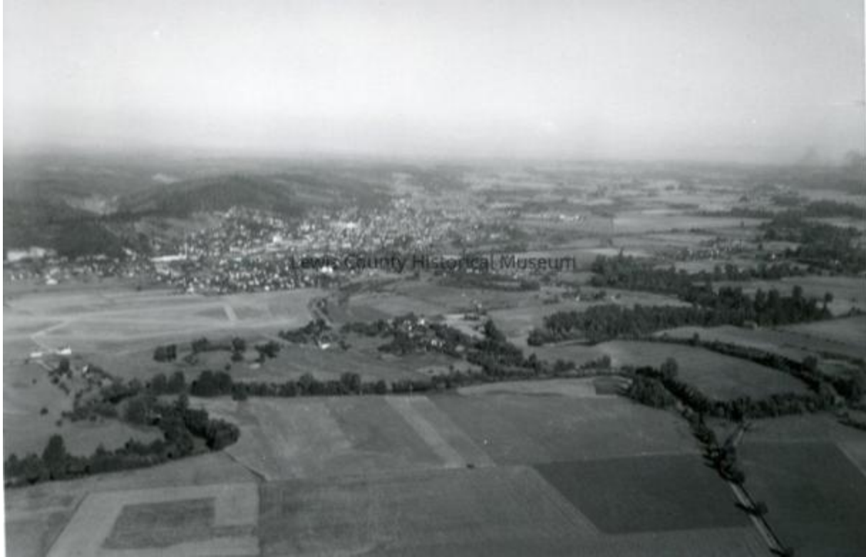
Riverside Golf Course with airport (center left) - c.1940