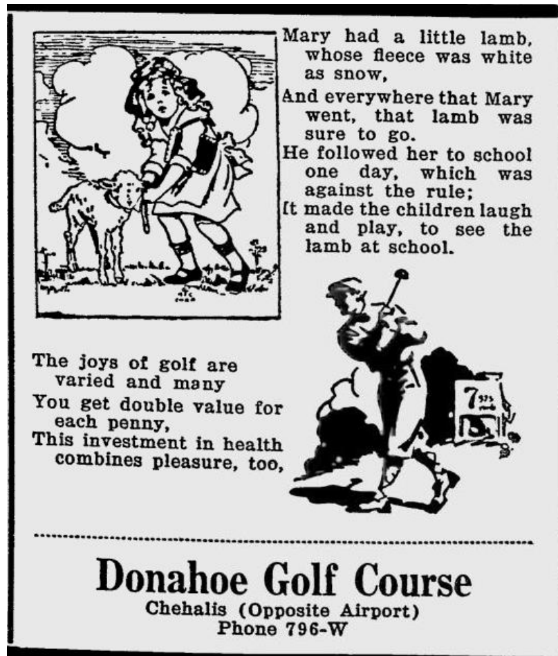
Ad for Donahoe (Riverside) Golf Course (Chehalis Bee-Nugget 11-8-1929)

On the surface, it may seem that a public course in a small population center competing against two nearby private clubs, the Centralia and Chehalis country clubs, combined with the Great Depression, would have doomed Riverside. However, in reality, the opposite was true. What proved to be the death knell for private clubs turned into a lifeline for many of the public courses. During the 1930s, a large number of members at private club were defaulting on their dues, or simply quitting outright. These were golfers who still wanted to play the game, but could no longer afford the monthly dues and assessments. They could play on public courses of their choosing more cheaply. That is not to say public courses prospered during the depression years, but that they survived due partly to this dynamic.